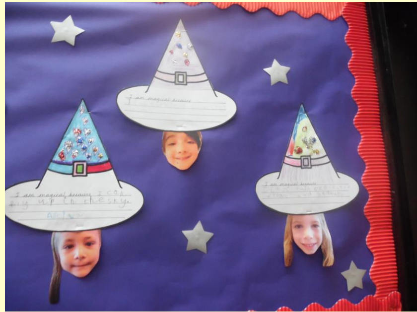
Display of writing in Year One