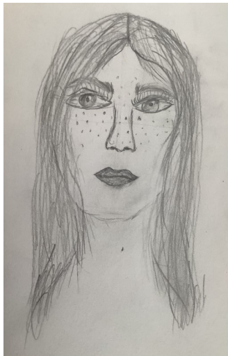
Self portraits drawn by Year 6.