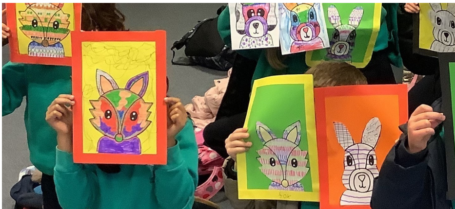
Artwork created by Year 2 during Craft Club.