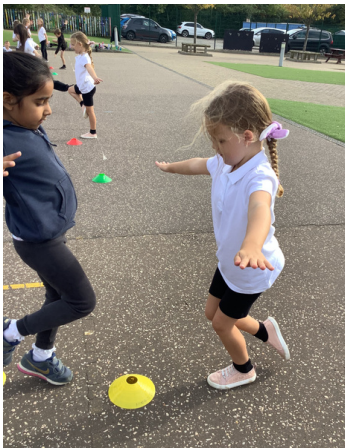
Year 2 were great at their static balances in PE-no wobbling here!!