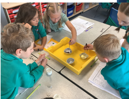
Year 4 made some models to show the parts of a river.