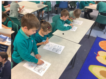
Year 1 are becoming great phoneme detectives. Here they are seeking the sound!