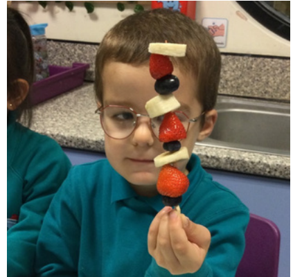
Reception enjoyed making their fruit kebabs.