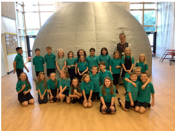
Year 5 loved the Planetarium visit on Wednesday as part of their science unit on Earth and Space.