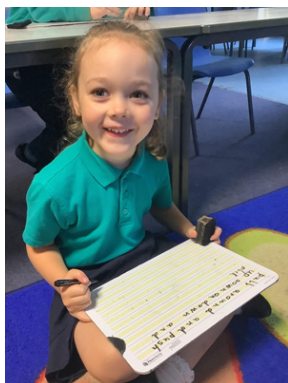
Year 1 are becoming experts at their letter formation.