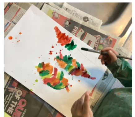
Year 2 have been experimenting with metallic wax crayons and inks to create some super leaf art work.