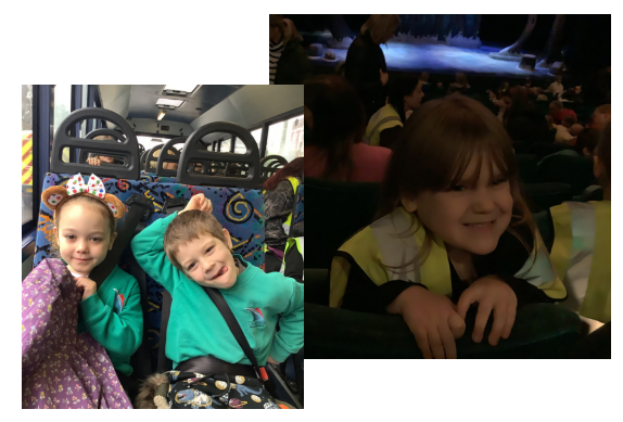
Our Year 1 classes enjoued their visit to the Theatre to see The Gruffalo.