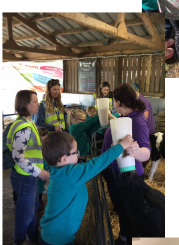
EYFS had a fantastic day at Wroxham Barns.