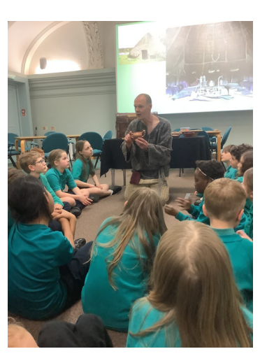
Year 4 had a fantastic time at Norwich Castle learning about the Romans.