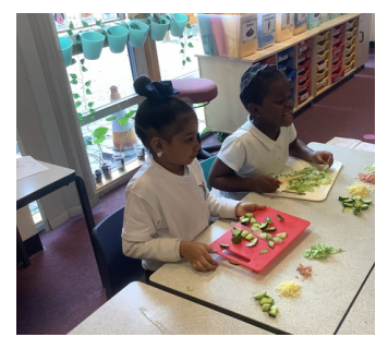
Year 2 selected their ingredients to make a healthy wrap.