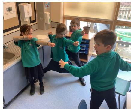
Year 1 learnt the story of Rama and Sita through drama as part of their RE lessons on Hinduism.