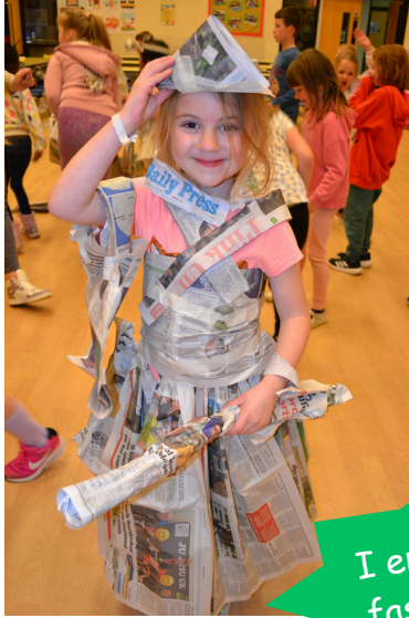
I enjoyed the fashion show!