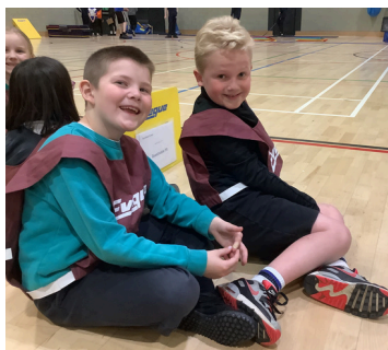
Well done to all the children who took part in the Sportshall Athletics.