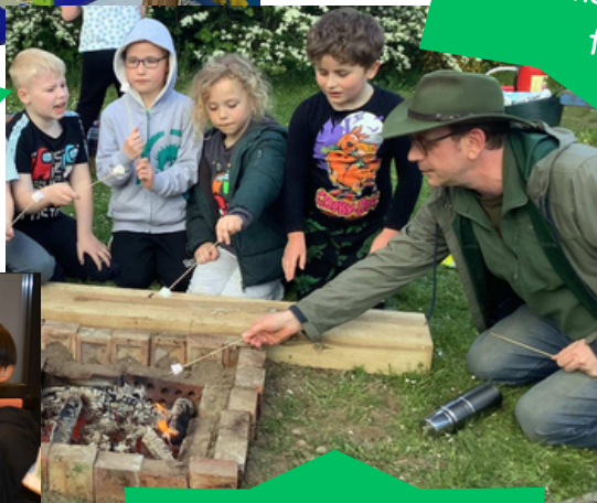
I was really proud of myself because I stayed all night.