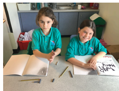
Pupils in Year 5 enjoyed experimenting with charcoal in their art lessons.