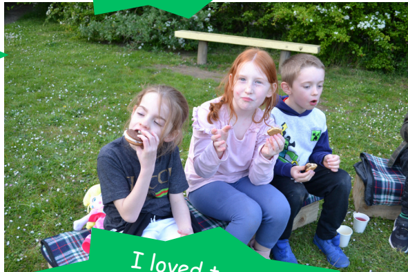
I loved toasting marshmallows on the fire.