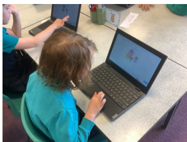
Year 2 used the Chrome Music Lab to create their own music on the computers..