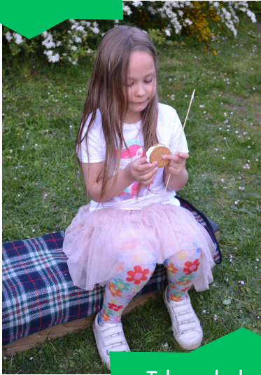
I'm sad because it is over!

On Friday evening, Year 2 children attended a sleepover at school. They began the night with some fun games then toasted some marshmallows on our new fire pit. The children then worked in teams to create designs for a fabulous fashion show before settling down for the night in the Reception classrooms. They were treated to tasty breakfast in the morning before getting ready to go home.