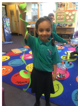
Our story in Reception this week is Jack and the Beanstalk. The children have been practising their cutting skills by making beanstalks