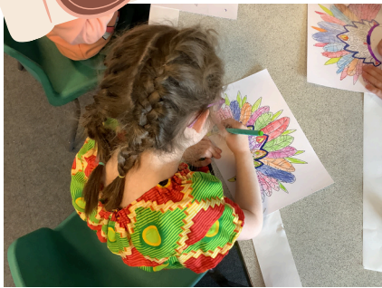
Year 2 enjoyed taking part in their colourful Jamaican festival afternoon.